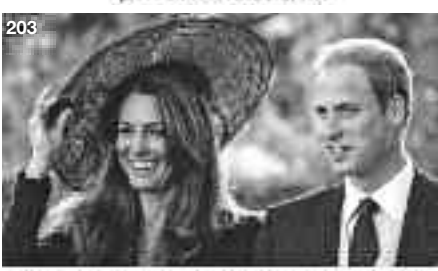
CURRENTELATIONS, CANADAS PUTTIKE KINN & OCCUPS

or shape requires us to use Canada Post parcel services, and the charge for packaging and shipping is the greater of $7.50 or 20% of your order: 190 (Queen Elizabeth book), 186 (table flag), 208 (tea spoon) 209 (thimble) and 212 (newspaper souvenir).