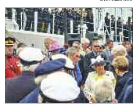
HM meets Navy families landside by HMCS St John's and HMCS Sackville, Halifax Harbour