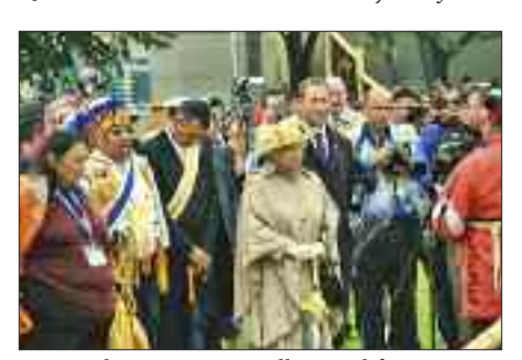
HM with First Nations allies, Halifax