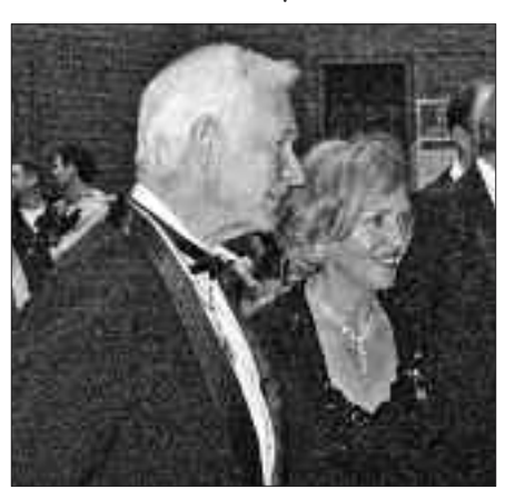
The Governor General greets attendees at the opening of the Royal Winter Fair, Toronto

Quite simply the Governor General is not getting good advice on matters related to the Crown and ceremonies. He remains surrounded by Ottawa bureau-