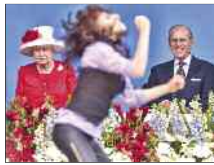
Differing Royal reactions to Canada Day performers!

HMS Sea Eagle in Northern Ireland, while I was on deployment with the RCAF. I told him how his uncle had entered the mess and after talking to several of the junior officers offered the comment that he was so well known that