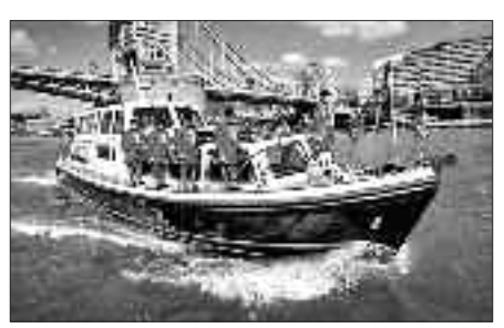
Refurbished Royal Barge with The Royal Bargemaster and The Queen's Watermen – likely to take part in Thames' Jubilee celebration

affirmation of Her Majesty's six-decade old oath of service and commitment. Its design is simple, yet striking, displaying Her Majesty's profile on the obverse, and several maple leaves and a pattern of diamonds on the reverse, all to signify the 60th anniversary celebrations. The colours of the ribbons are symbols of continuity. The red, blue and white are reminiscent of the 1953 Coronation Medal, the 1977 Silver Jubilee Medal, and the 2002 Golden Jubilee Medal. Each of these medals was created to commemorate a particular milestone during Her Majesty's reign... The announcement of this medal begins the celebration that will mark this auspicious and unique occasion in our country's history. I feel honoured and privileged to represent the Crown in Canada. Let me end by reciting the words inscribed on the medal - Vivat Regina, "Long live The Queen."