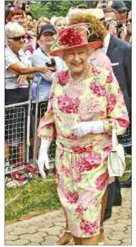
Queen's Park walkabout.