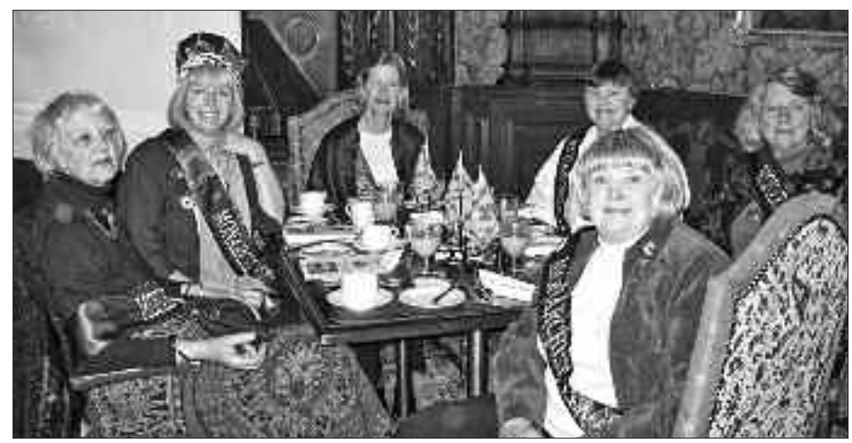
Some Victoria Branch members enjoy Wedding Morning at the Empress Hotel