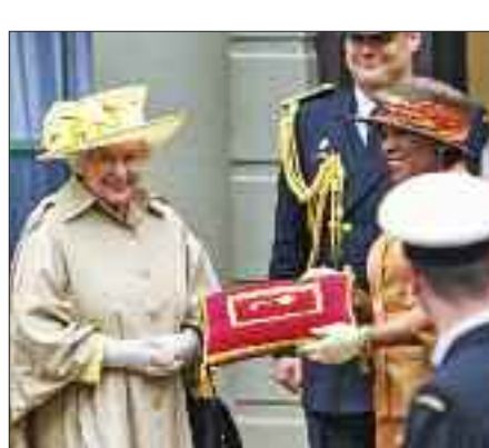
The Lieutenant Governor presents The Queen with the key to her house! Nova Scotia's Government House, the oldest vice-regal residence in the Americas, restored after three years.

In the 30 minutes prior to the Royal Couple's arrival, the rain began to let up.