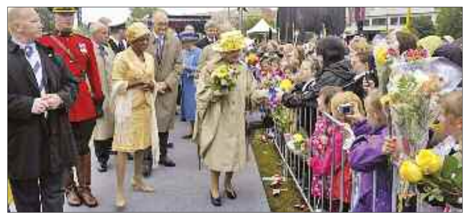
Queen arrives in Canada to a rainy Halifax but warm welcome.