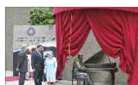
HM unveiled the Oscar Peterson statue in Ottawa on June 30

the Governor General and Prime Minister and came down our walk. She stopped across from me to talk to veterans and just as I was stretching my arm with flowers out a tall figure in a blue blazer grabbed them and in a gruff High-English accent said 'D'you want me to pass them on?' and before I could get angry at my flowers being snatched I realized it was Prince Philip and gaping said 'Yes, Your Royal Highness, thank you.' He called the Queen over and handed off the flowers and she nodded to me and said 'Thank you.' and I breathlessly replied 'Your Majesty' and nodded back. BUT the most encouraging surprise of all was that the Prime Minister stepped forward, pointed at my sign and said 'Well done. That's an awesome sign.' and, regardless of my place on the political spectrum and what I think of the PM, I gratefully and honestly answered 'And thank YOU for what you're doing for the cause.' to which I got a thumbs up and a smile. The entourage passed and I was quite honestly trembling to the point that I couldn't really write my name and contact info properly for the guy beside me who had taken pictures. I then contacted my entire family and nearly yelled the whole thing to them. I am so proud of this country and it's Queen and feel really edified to have the Prime Minister himself acknowledge my feeble attempts at activist monarchism.