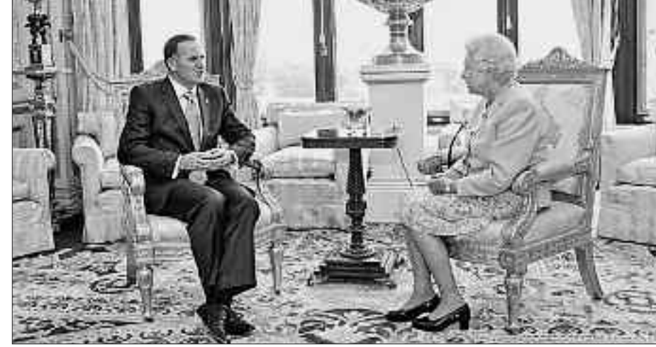
New Zealand Prime Minister John Key restored titular honours in 2008

In Part 2, "The Break-Up of Empire", Noel Cox traces the gradual move of the dominions to full autonomy under the Crown. This subtle process has intrigued and perplexed many scholars, for, unlike the case of republican revolutions or declarations of independence, it is difficult if not impossible to pinpoint the moment at which Australia, Canada or New Zealand became independent. In Chapter IV, Dr. Cox cites Canada's Brian Slattery and Peter Hogg to the effect that Canada's formal legislative independence was achieved as a political reality "some-