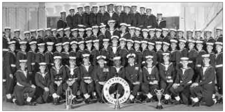
1966 Royal Canadian Navy training graduates

I have asked a lot of people how they feel about this motion. They all love it. I have not met anyone who does not like "Canadian Navy," but I have not met anyone who wants the word "Royal" back.