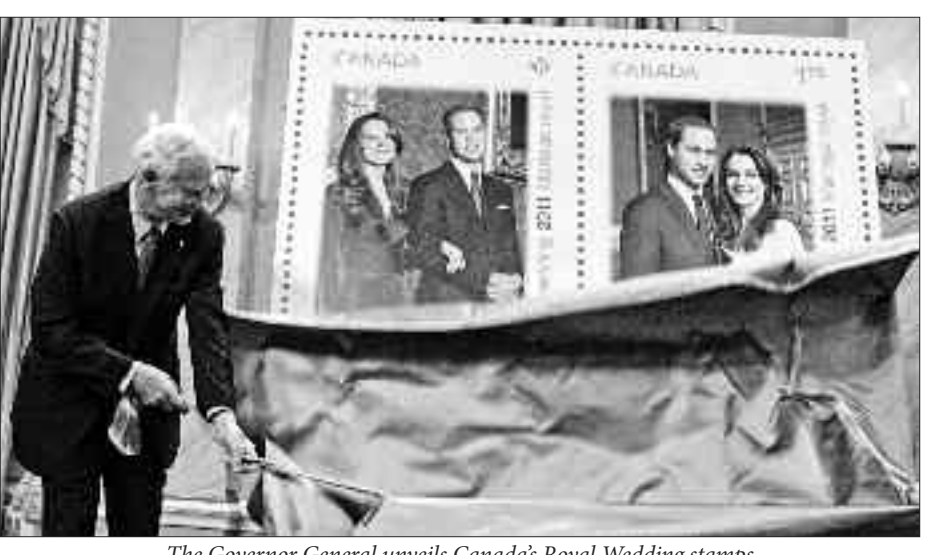
The Governor General unveils Canada's Royal Wedding stamps te of the Secretary to the Governor General of Canada 2011. Photo credit: Sgt Serge Gou Reproduced with the permission of the Office of the Secretary to the Governor General