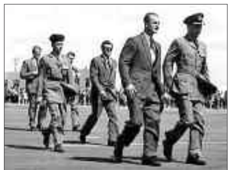
Duke visits RCAF training base during 1954 solo Canadian tour

In addition to many duties with his Regiments here, and with assorted pat-