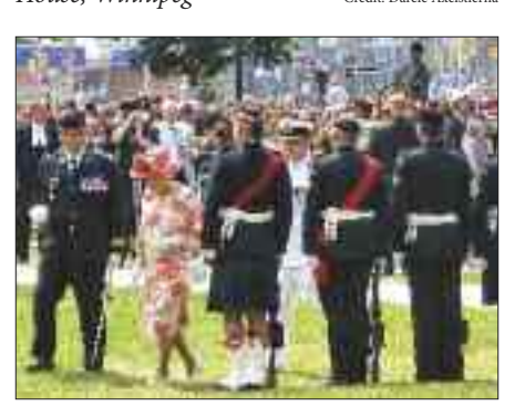
Queen's Park, July 6: Farewell to The Queen