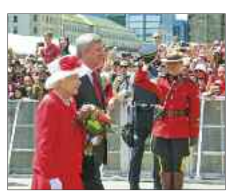
Record crowds cheer as the Prime Minister leads The Queen to the Dais for the Noon observance of Canada Day on Parliament Hill