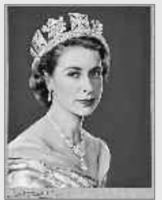
of The Queen is included in The Queen: Art and Image