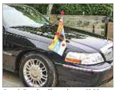
Queen's Canadian Flag on her car, Halifax