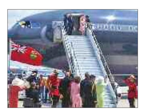
HM waving from plane at Pearson