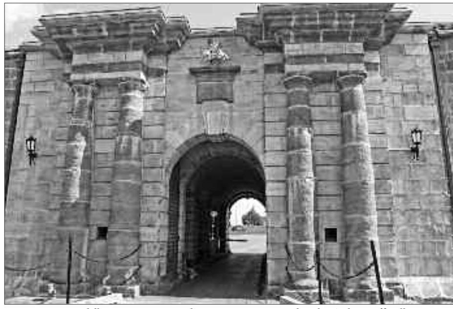
La Citadelle: aucune peinture du Souverain se trouve dans la résidence officielle du GG dans La Veille Capitale de Québec

[En raison de la longueur de cette édition, la version anglaise de l'article de Sénateur Joyal sera publié dans l'édition suivante de NMC. Because of the length of this issue of CMN, the English version of Senator Joyal's article will be pubished in the next edition. Ed.]