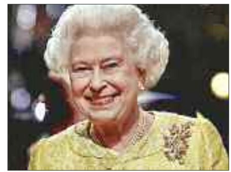
HM wearing Maple Leaf Brooch at Nova Scotia Government evening Reception