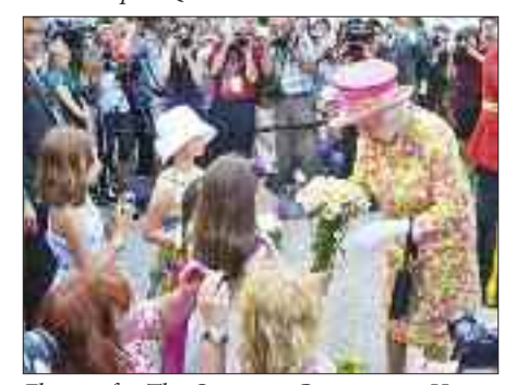
Flowers for The Queen at Government House, Winnipeg.

the Governor General and Prime Minister and came down our walk. She stopped across from me to talk to veterans and just as I was stretching my arm with flowers out a tall figure in a blue blazer grabbed them and in a gruff High-English accent said 'D'you want me to pass them on?' and before I could get angry at my flowers being snatched I realized it was Prince Philip and gaping said 'Yes, Your Royal Highness, thank you.' He called the Queen over and handed off the flowers and she nodded to me and said 'Thank you.' and I breathlessly replied 'Your Majesty' and nodded back. BUT the most encouraging surprise of all was that the Prime Minister stepped forward, pointed at my sign and said 'Well done. That's an awesome sign.' and, regardless of my place on the political spectrum and what I think of the PM, I gratefully and honestly answered 'And thank YOU for what you're doing for the cause.' to which I got a thumbs up and a smile. The entourage passed and I was quite honestly trembling to the point that I couldn't really write my name and contact info properly for the guy beside me who had taken pictures. I then contacted my entire family and nearly yelled the whole thing to them. I am so proud of this country and it's Queen and feel really edified to have the Prime Minister himself acknowledge my feeble attempts at activist monarchism.