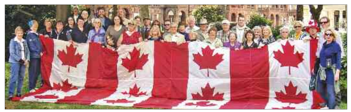
Some of the Monarchist League's Royal Wedding tour participants with the Canadian Flag quilt that attracted so much attention in London.

Secondly: youth, youth, youth. The crowds were so young. And how healthy that they were there celebrating the solemnization of love and national family