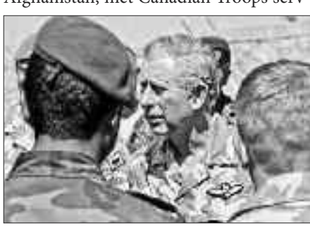
Canadian media ignored Charles' meeting with our troops and Ambassador

CROWN to HRH The Prince of Wales, who on a Spring, 2010 visit to Afghanistan, met Canadian Troops serv-