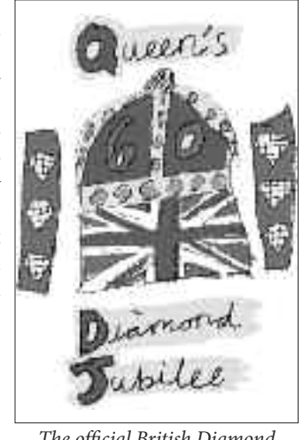
The official British Diamond Jubilee symbol

expects prominent participation by some of the younger members of the Royal Family. The flotilla will assemble at high water on the Sunday afternoon, and will be one of the largest ever to sail on Father Thames. Lord Salisbury promises the assembly honouring the Jubilee will include row boats, working boats, pleasure vessels, tugs, historic boats, steam vessels and a variety of "official" craft from the Royal Navy, police, fire and rescue services.