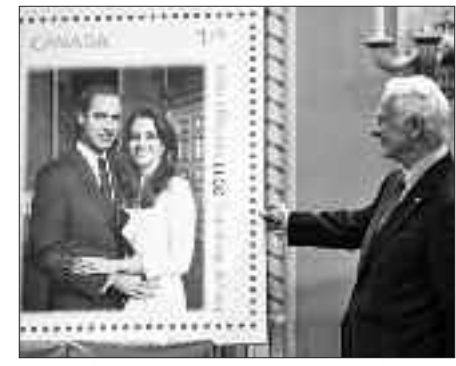
The Governor General admires the international-rate version of Canada's Royal Wedding stamps

Après quelques rencontres de membres de la Ligue (je peux enfin associer des visages et des noms!), je quitte la propriété les yeux encore brillants de tout ce que j'ai vu, mais... oh! J'oublie presque... J'étais en train partir sans le carton