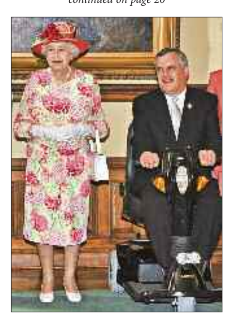
The Queen with her most loyal Ontario representative, in the Vice-Regal Suite, Queen's Park, July 6, 2010

Once Her Majesty was presented with the Royal Key, I escorted her into Government House where I introduced her to the household staff. This was followed by a tour of the main public rooms. After the tour, a photograph was taken of Her Majesty and the Provincial cabinet. The continued on page 20