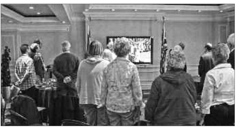
Standing for the National Anthem while viewing Royal Wedding at Macdonald House