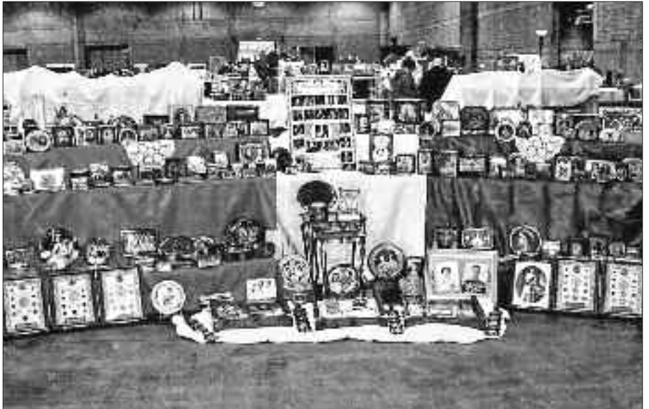
Ray Ewaskiw's amazing collection of monarchical tins!